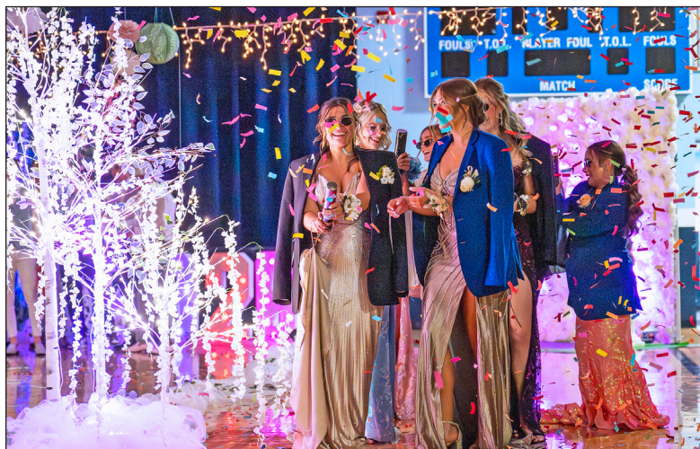
Silly string and confetti poppers, along with air horns, added to the fun during Leola and Frederick Area's joint prom on March 28.