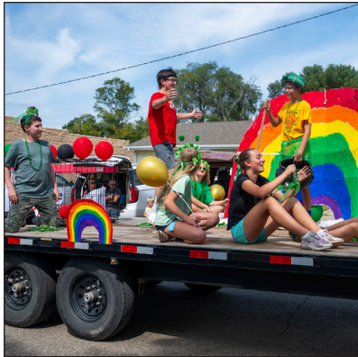
St. Patrick's Day was the theme for the eighth-graders.