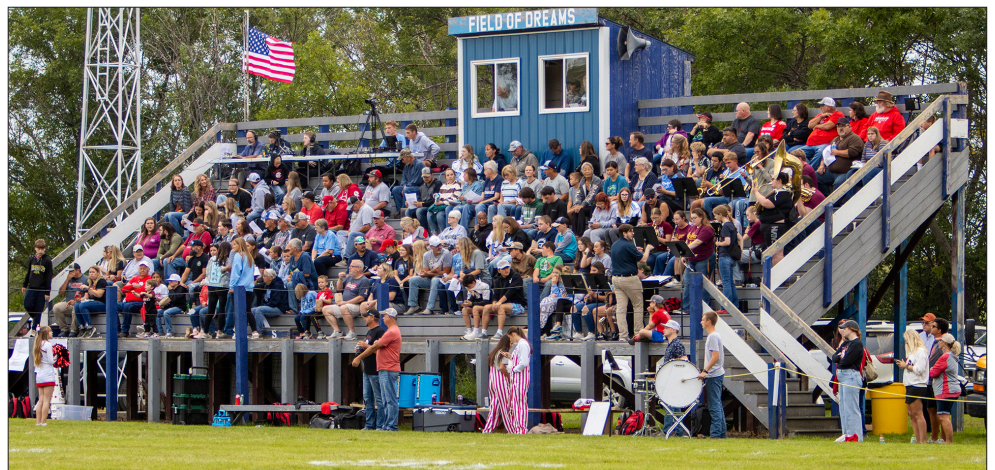
The stands were full for the Homecoming football game.