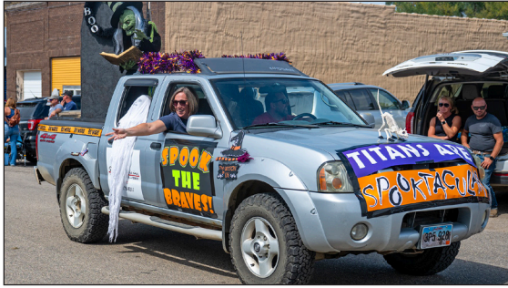
ABOVE: Schwan Electric rolled with a Halloween theme. BELOW: Many community organizations and businesses took part.