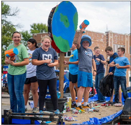
ABOVE: Sixth-graders celebrated Earth Day on their float. BELOW: Freshmen had a Fourth of July theme.