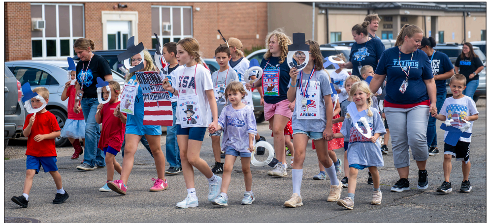
Fifth-graders and kindergartners had a Presidents Day theme.