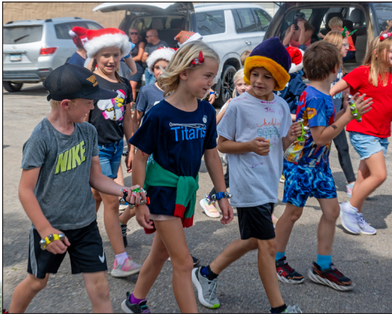
Students cleaned up candy on their second pass on Main Street.