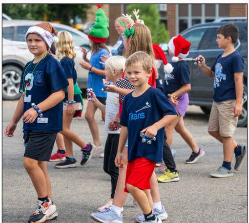
First- and third-graders had a Christmas theme.