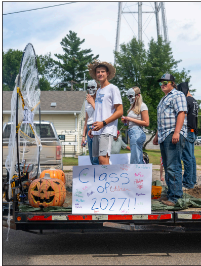
Juniors had a scary Halloween theme.