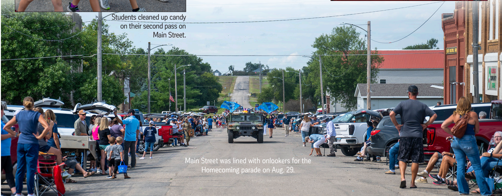
Main Street was lined with onlookers for the Homecoming parade on Aug. 29.