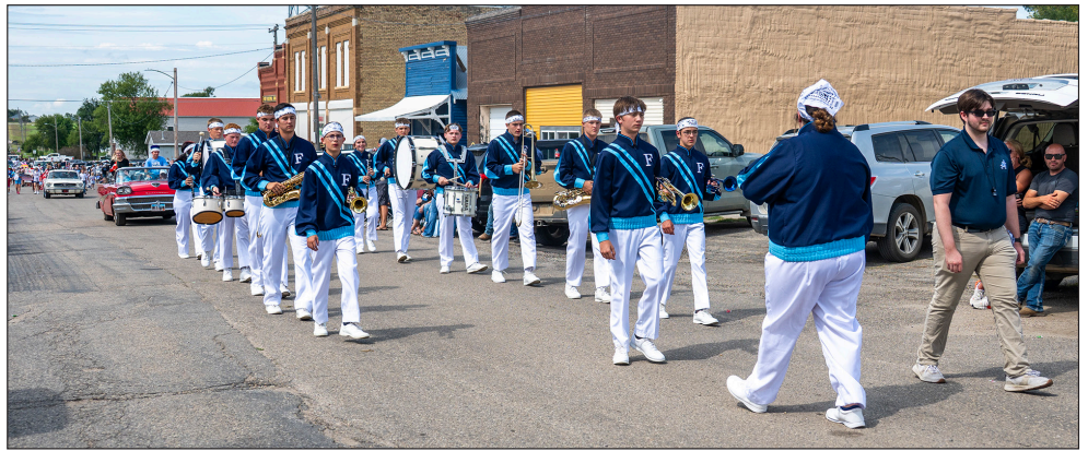
The Homecoming parade was the first of several marching events this fall for the Frederick Area Band.