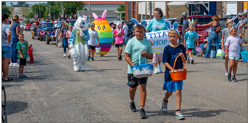
The overall theme of the Homecoming parade was Holidays. Second- and fourth-graders had an Easter theme.