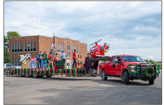
The class of 2028 had an elaborate Christmas theme.