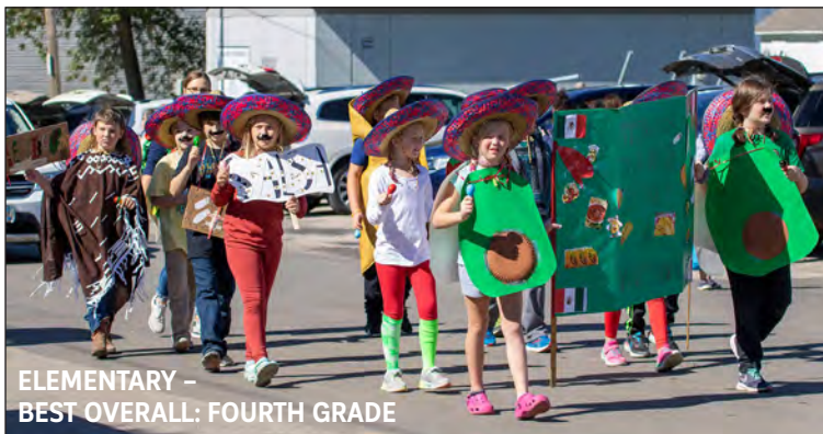
ELEMENTARY – BEST OVERALL: FOURTH GRADE