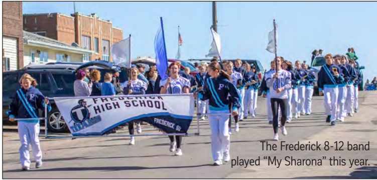
The Frederick 8-12 band played "My Sharona" this year.