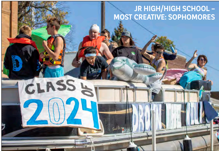
JR HIGH/HIGH SCHOOL – MOST CREATIVE: SOPHOMORES