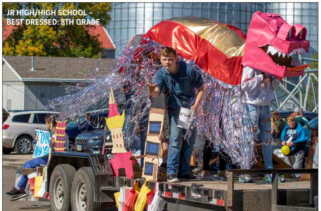
JR HIGH/HIGH SCHOOL – BEST DRESSED: 8TH GRADE