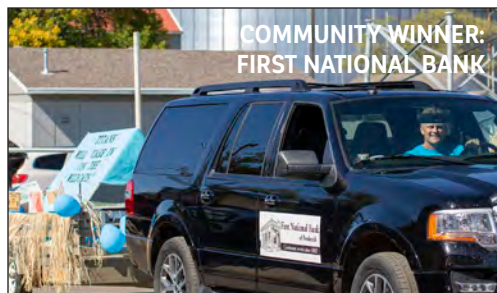
COMMUNITY WINNER: FIRST NATIONAL BANK