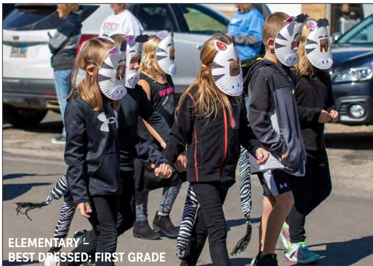
ELEMENTARY – BEST DRESSED: FIRST GRADE