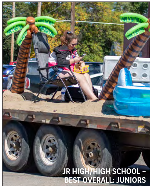
JR HIGH/HIGH SCHOOL – BEST OVERALL: JUNIORS