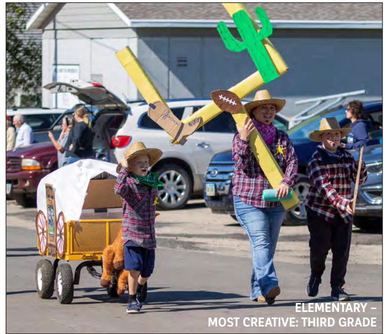
ELEMENTARY – MOST CREATIVE: THIRD GRADE

Parade winners are pictured on these two pages, labeled with their division and the award they won. See photos of other parade entries on the Frederick SD Facebook page.