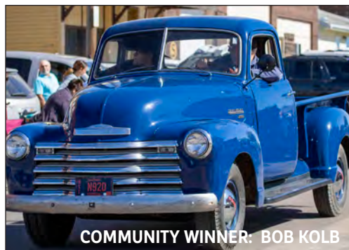
COMMUNITY WINNER: BOB KOLB