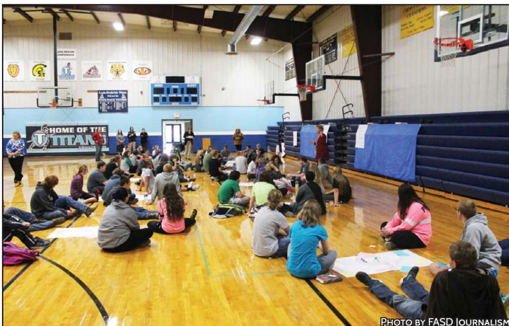
Empower! Dakota Community Engagement by Dakota Resources meets with Frederick Area students.