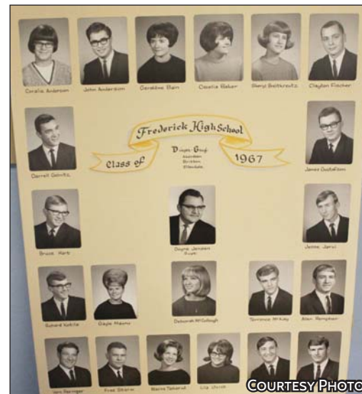
Frederick HS Class of 1967