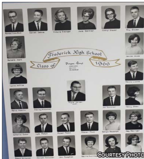
Frederick HS Class of 1966

February 20th - 23rd, yearbooks will be $30.00 each and $10.00 for each additional yearbook purchased for a sibling.