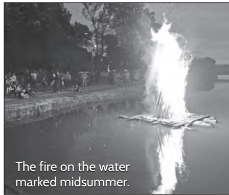
The fire on the water marked midsummer.