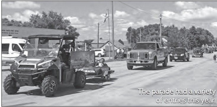
The parade had a variety of entries this year.