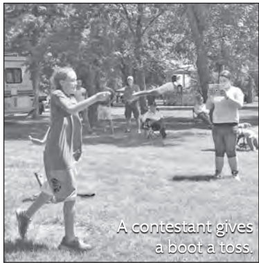
A contestant gives a boot a toss.